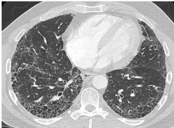
Figure 1 HRCT cross-sectional view showing a pattern of peripheral reticulation and honeycomb change that is diagnostic of the presence of UIP.

areas with extensive fibrosis. In addition to total and differential BAL cell counts, BAL fluid and sediment can be analyzed for infection or the presence of malignant cells, and the gross appearance of freshly retrieved BAL fluid may provide diagnostic information (e.g. progressively increasing blood in sequential aliquots that is seen with diffuse alveolar hemorrhage or white-tan discoloration of the BAL fluid with rapidly settling tan sediment [due to gravity] that can be seen with pulmonary